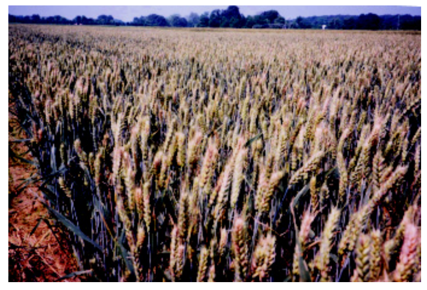
A field of soft red winter wheat near Queenstown, Maryland, damaged by scab; photo was taken in June, 2003.

This and other FHB research, such as screening germplasm and varieties for FHB resistance, is funded in part by the U.S. Wheat and Barley Scab