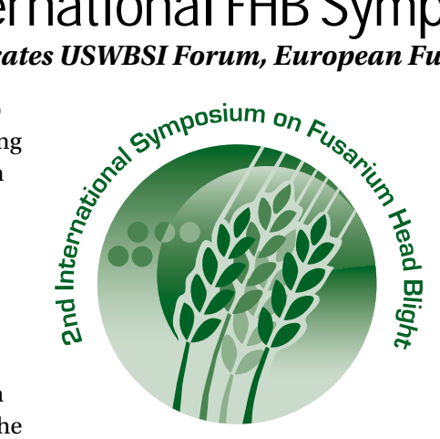
Incorporating the 8th European Fusarium Seminar

"We expect representation from 20 or more countries, so this symposium is likely to be the largest