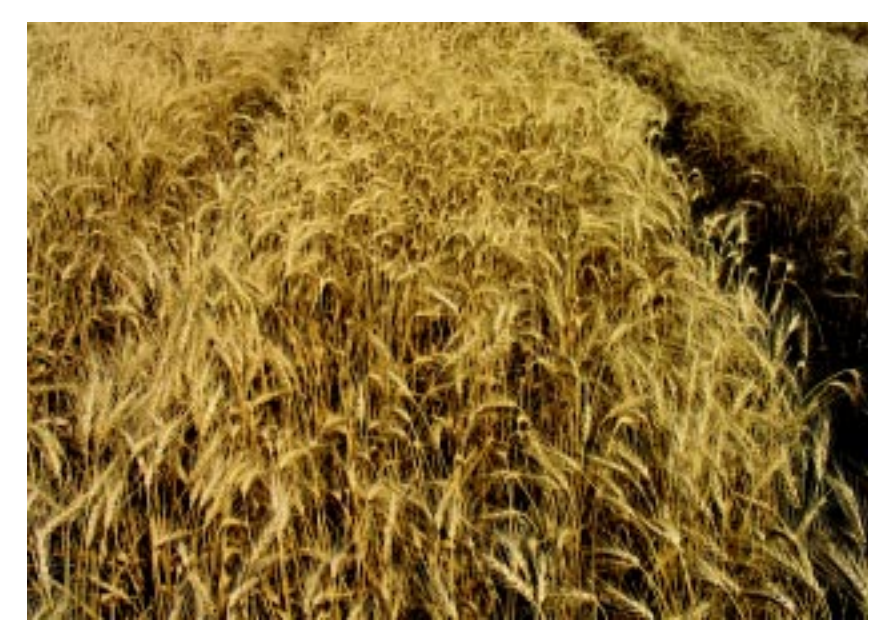
A test plot of Steele-ND, which will be increased as certified seed this year and will be generally available to the public for production in 2005.