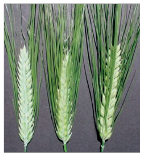
Figure 1. Left to right: Clho4196, Mutant G07-014 and cv. Morex Spikes.

The mutant, designated G07-014, was isolated in a gamma irradiated Clho4196 M2 population (proposed gene and allele designation vrs1.u ). The mutant phenotype was confirmed in Pullman, Wash., during the summer of 2008 and genotype confirmed by sequencing. Sequence analysis revealed that the mutant vrs1 gene has a 9 nucleotide (nt) deletion compared with the wild-type Clho4196 vrs1 gene (Fig. 2). FHB resistance of the mutant was comparable to Clho4196 in China dur-