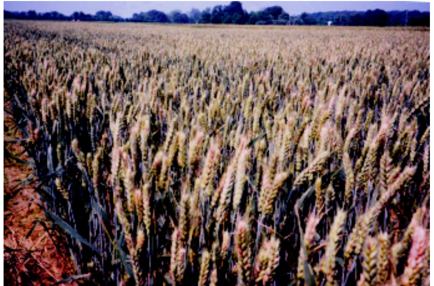
A field of soft red winter wheat near Queenstown, Maryland, damaged by scab; photo was taken in June, 2003.

This and other FHB research, such as screening germplasm and varieties for FHB resistance, is funded in part by the U.S. Wheat and Barley Scab